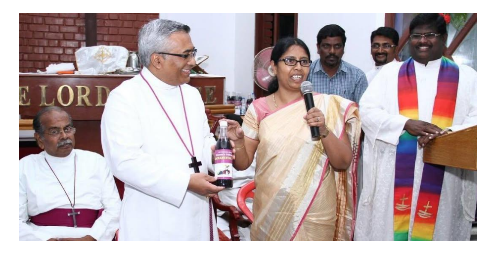
Noah's Ark (Therapy Centre)

should give what you have decided in your heart to give, not reluctantly or under compulsion, for God loves a cheerful giver." Through this initiative, the Fellowship not only meets the needs of the community but also demonstrates the love of Christ in practical ways.