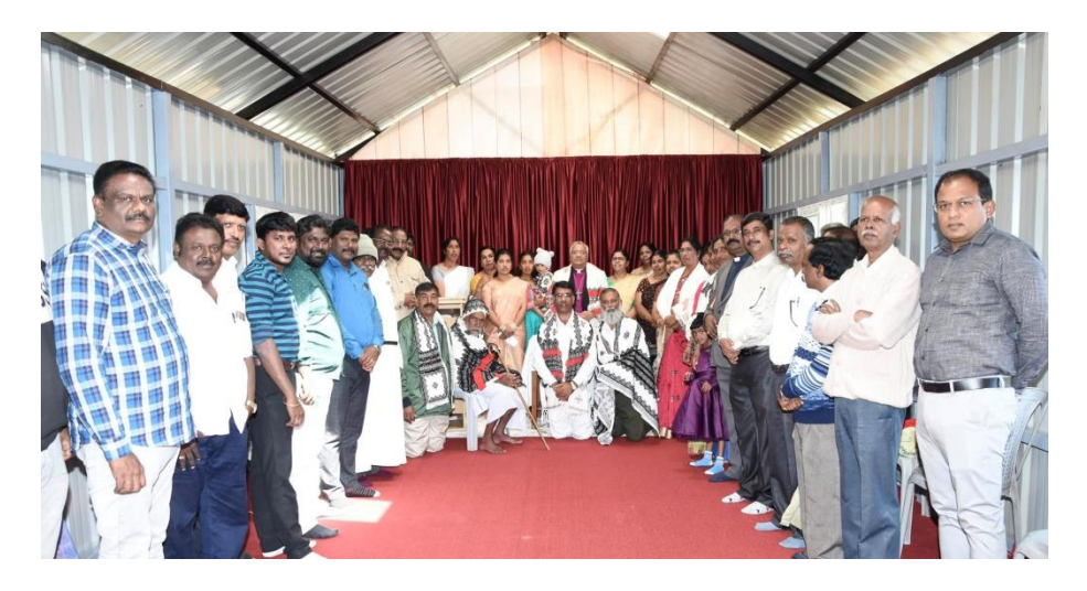
The fundraising efforts have been nothing short of extraordinary, reflecting the generosity and commitment of the people within the Diocese. ₹71 lakhs was raised during the 2015 Mission Festival, and ₹10,90,036 was collected through Self-Denial covers and hundial offerings between 2016 and 2019. These funds have enabled the mission to carry out its work and further advance God's Kingdom, in line with 2 Corinthians 9:7: "Each of you should give what you have decided in your heart to give, not reluctantly or under compulsion, for God loves a cheerful giver."

field, God's building." The Diocese has worked tirelessly to ensure that the infrastructure supports both worship and community engagement.