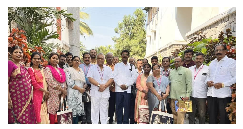
Material and Financial Support