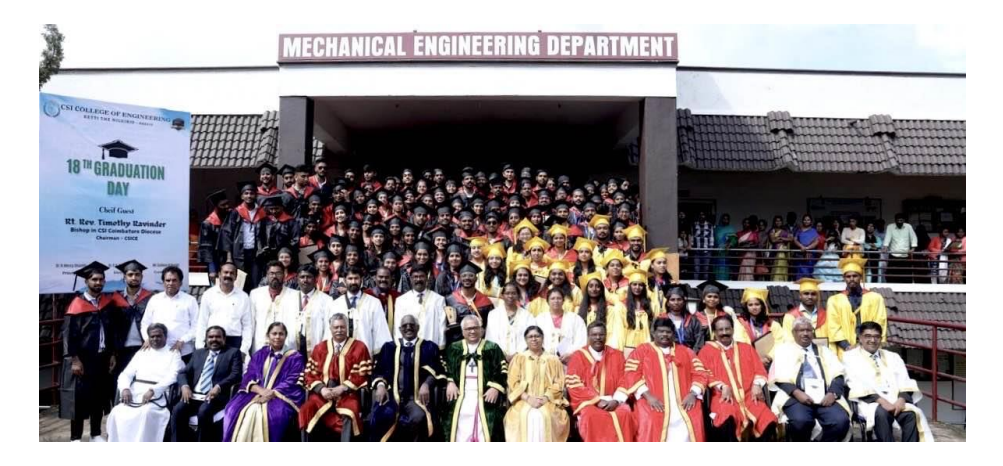
In 2024, CSI College of Engineering, Ketti (Nilgiris), celebrated its 18th Graduation Ceremony, continuing its tradition of excellence. The event honored graduates for their dedication and hard work, with special recognition for rank holders who excelled in engineering. A significant highlight was the dedication of the CSI Platinum Jubilee Arena, symbolizing the institution's growth and commitment to innovation.

the faculty and staff were commended for their efforts in making the event a success. The Secretary and Principal were praised for their leadership, and the graduates were sent off with blessings for their future endeavors.