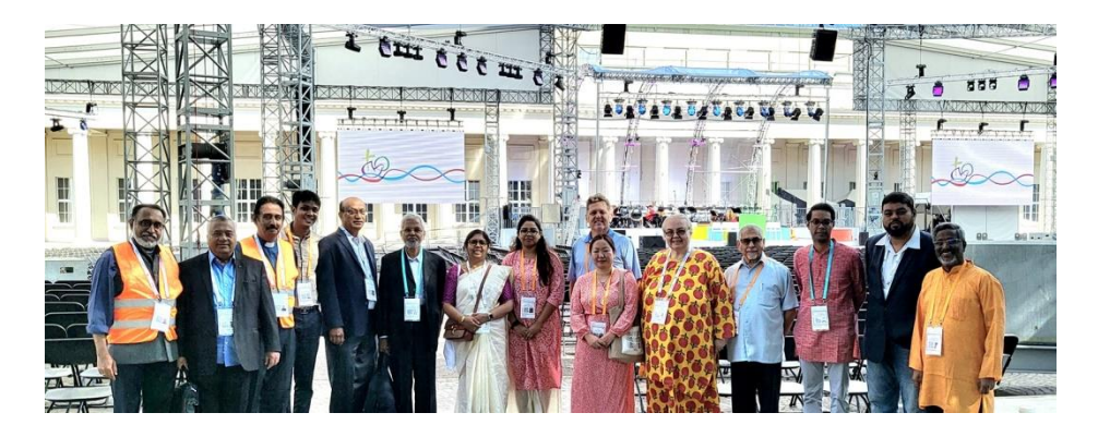
The Diocese has also played an active role in ecological missions in Sri Lanka, underlining its dedication to environmental stewardship as an essential aspect of Christian discipleship. These missions have included workshops, tree-planting drives, and community programs aimed at promoting sustainable living and addressing ecological concerns. Inspired by passages like Genesis 2:15, "The Lord God took the man and put him in the Garden of Eden to work it and take care of it," the Diocese has integrated ecological care into its global mission strategy, serving as a witness to the transformative power of faith-based environmental action.